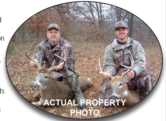
ACTUAL PROPERTY PHOTO

Tracts 6 & 7: Browning, Missouri - Sullivan County (Tract 6: 30 acres with 25 tillable. Tract 7: 40 acres with 30 tillable.) This is a great investment farm, highly tillable, gently rolling crop ground. These tracts are located just 1 1/2 miles NE of Browning on Woodland Drive only 1/4 mile apart. Tracts are not leased for 2012. In section 34 - 61-20.